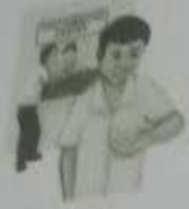
21 June booked the ticket