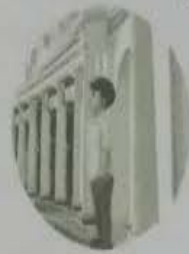
4 July visited Connaught Place