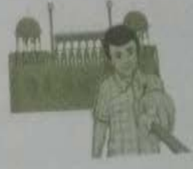
1 July visited the Red Fort