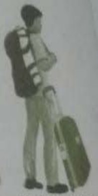
7 July returned to Dehradun