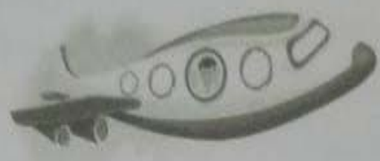
30 June flew in a plane to Delhi