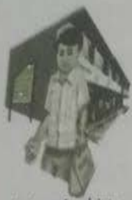
2 July bought shirts from Janpath