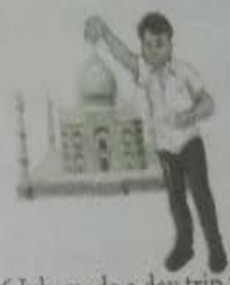
6 July made a day trip to Agra to see the Taj Mahal